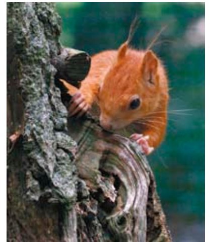
Red Squirrel

revive yourself by paying a visit to the Courtyard Café for a warming bowl of freshly-made soup, a home-made scone or a cup of tea?